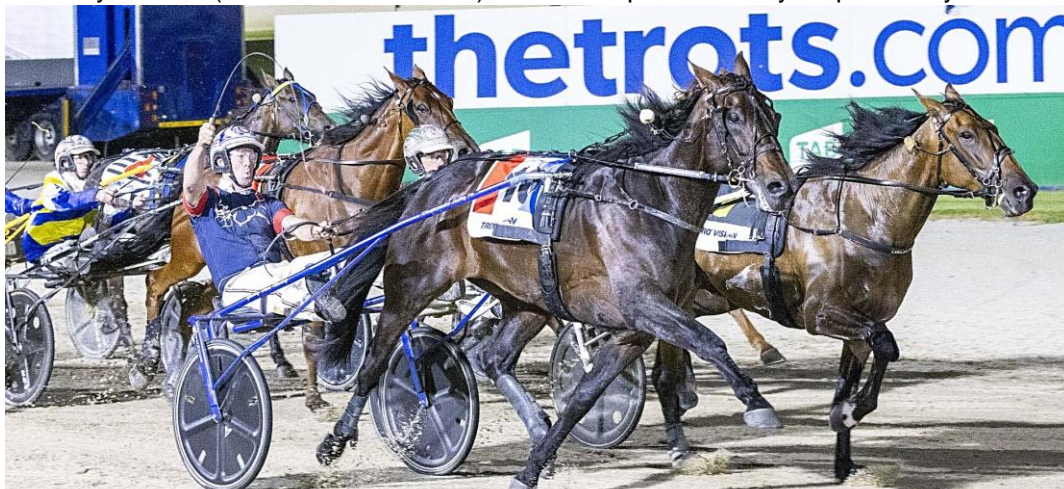
Callmethebreze just getting the better of Just Believe in the Great Southern Star

Callmethebreze FRA (Trixton USA) who was super impressive winning a heat and the final of the Great Southern Star. Before that he is a likely starter in the Group 1 Hammerhead on Miracle Mile night.